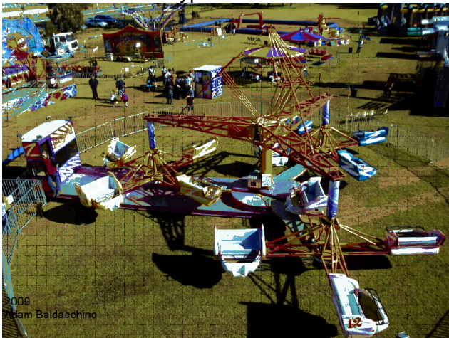
Photograph 1 – View of a Whizzer-type ride

This safety alert is to inform amusement ride operators of hazards associated with the operation of Whizzer-type amusement rides. Control measures to minimise the risk of serious injuries are also included. Photograph 1 shows a view of a Whizzer-type ride.